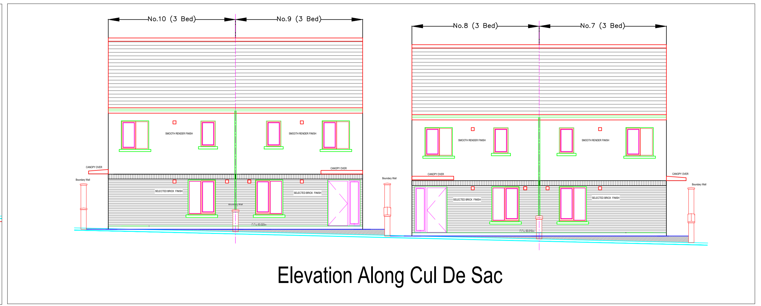
Elevation Along Cul De Sac